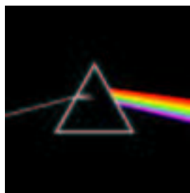
FIG. 3: Sample figure demonstrating that a bit-mapped image can be displayed as a figure.

than typesetting software (such as \text{\TeX} ) it is entirely acceptable and appropriate to put the figures and tables on separate pages at the end of your paper. If you do so, be sure that they are labeled with figure and table numbers and proper captions.